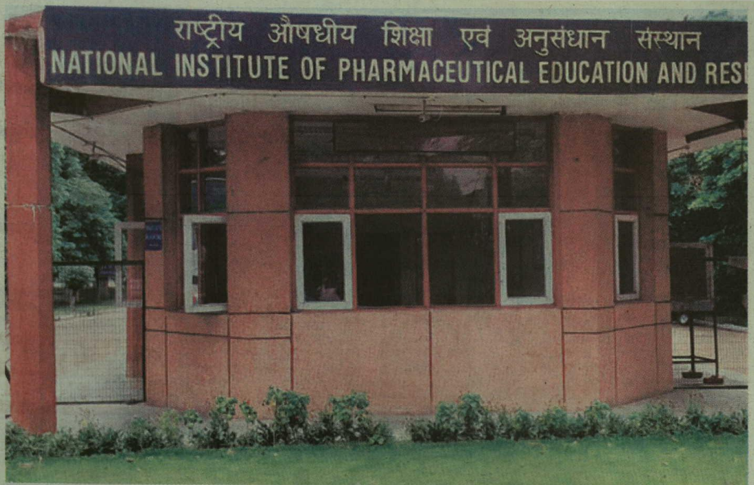
The National Institute of Pharmaceutical Education and Research sold a patent to a Gurgaon-based firm for less than ₹20 lakh. Former scientists have alleged that the institute lacks transparency and overlooked national interest.